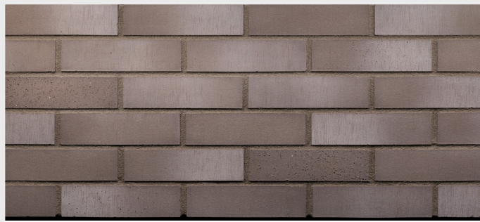
Winter Field | King 9/16" Size

HIGH QUALITY THIN BRICK MANUFACTURED FOR INTERIOR / EXTERIOR USE.